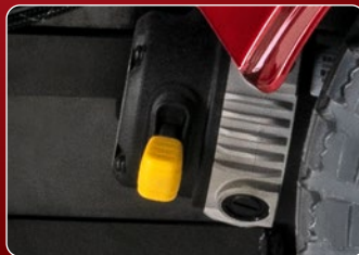
Extremely efficient motor package

The Jazzy® 1450 offers heavy-duty construction and performance components. This bariatric power chair features a 600 lb. weight capacity, front-wheel drive for superb indoor maneuverability in the tightest of spaces and large front drive wheels for extra absorption over obstacles. The Jazzy 1450 combines superb climbing capabilities with front anti-tips for transitioning over grade changes and handling various terrains easily.