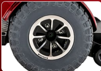
Superb traction, flat-free, drive tires